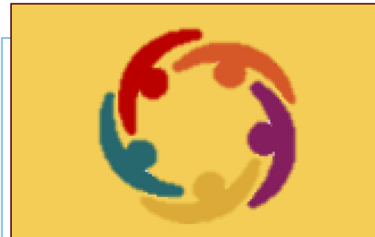
Ohio Family Engagement Center